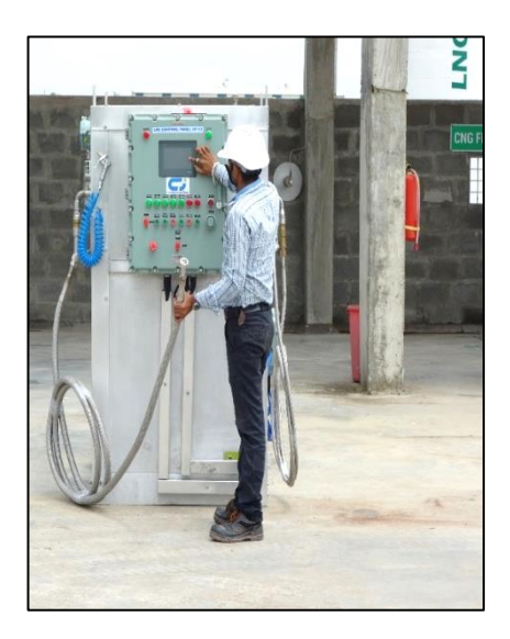
LNG Dispensers Courtesy: Cryogas equipment Pvt Ltd – Shop picture

Registered Office: A-36 Ghanshyam Nagar Society - 2, GIDC Road Manjalpur, Vadodara - 390 011 INDIA Telephone: (91) 265 266 22 88, 266 2236, Fax: (91) 265 266 2047, E-mail - iwinayan@iwicryo.com