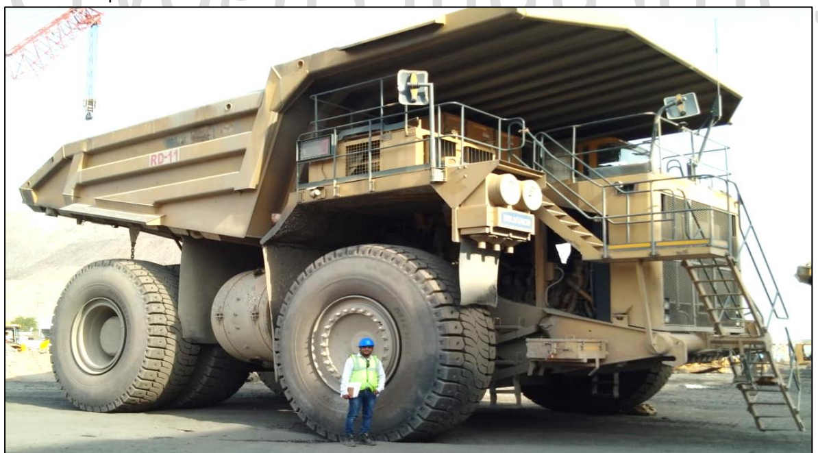
225 MT Payload dumper truck

(D) Vacuum Insulated Pipelines are used for transfer LNG from Tankers to Storage Tank and from Storage Tank through the LNG Dispensing pump to LNG dispenser for refuelling LNG fuelled Dumper trucks.