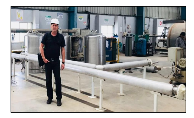
Vacuum Insulated LNG transfer cryogenic pipeline